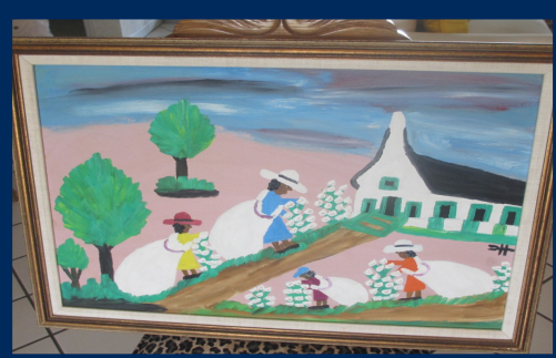
Clementine Hunter folk art $4,100.