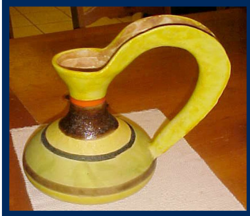
Guido Gamboni vase $2,015.